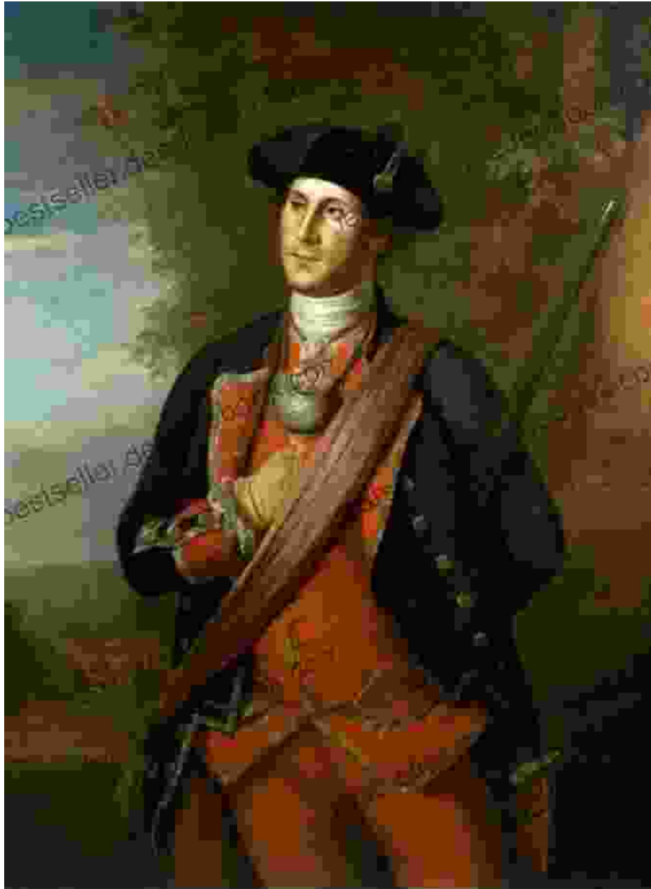
George Washington as a young military officer

Washington's military talents were quickly recognized, and he rose rapidly through the ranks. He served as a major in the French and Indian War (1754-1763), where he gained valuable experience in frontier warfare and the intricacies of military command.