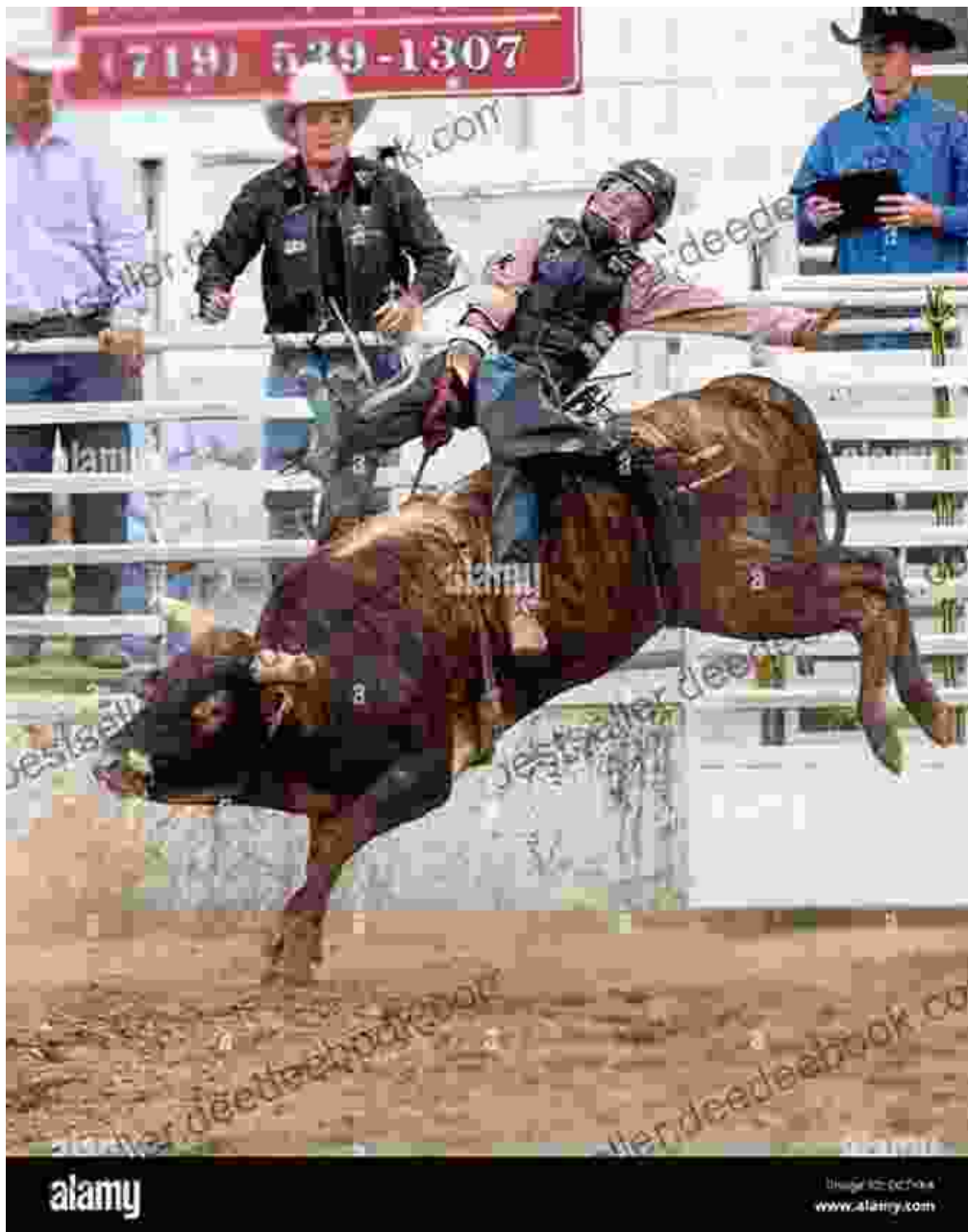
Bull riding competition

packed with spectators, and the energy was electric. I witnessed some of the most skilled bull riders in the country battle it out for the coveted championship title.